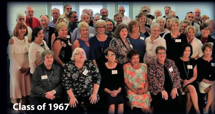
Class of 1967

Class of 1978: September 2, 2018 (Sunday of Labor Day weekend ~ fireworks!) at Paul Brown Stadium in the Club East Lounge. Please visit the class website http://www.oakhills78.com/ and be sure to update your contact information to stay informed.