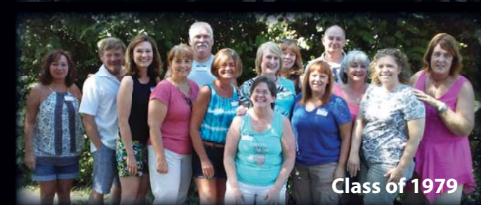
Class of 1979